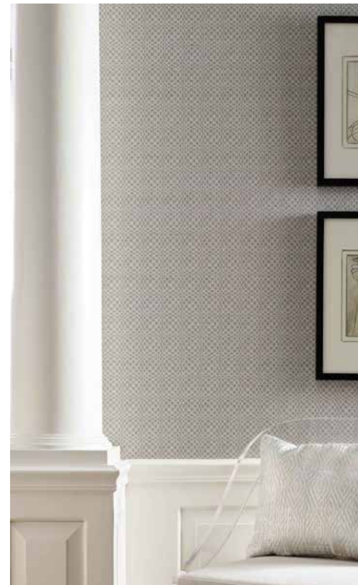
Eyepop | 34" wide | 2.83" horiz. x 3" vert. repeat | 8 yd. rolls

Create excitement with this energetic, futuristic thriller. Executed in muted tones, Eyepop conveys refinement with an edge.