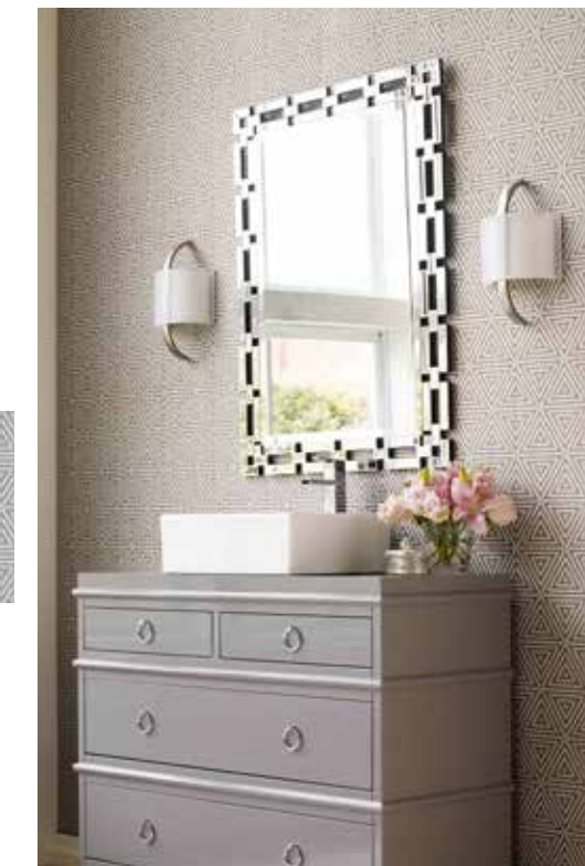
Star | 34" wide | 17" horiz. x 18" vert. repeat | 8 yd. rolls