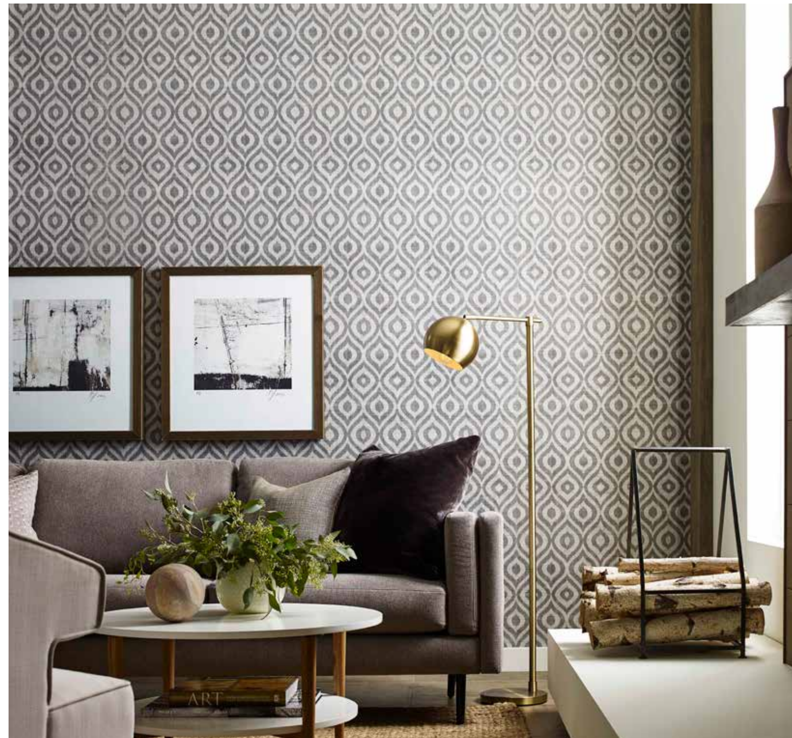
Batik | 34" wide | 17" horiz. x 18" vert. repeat | 8 yd. rolls