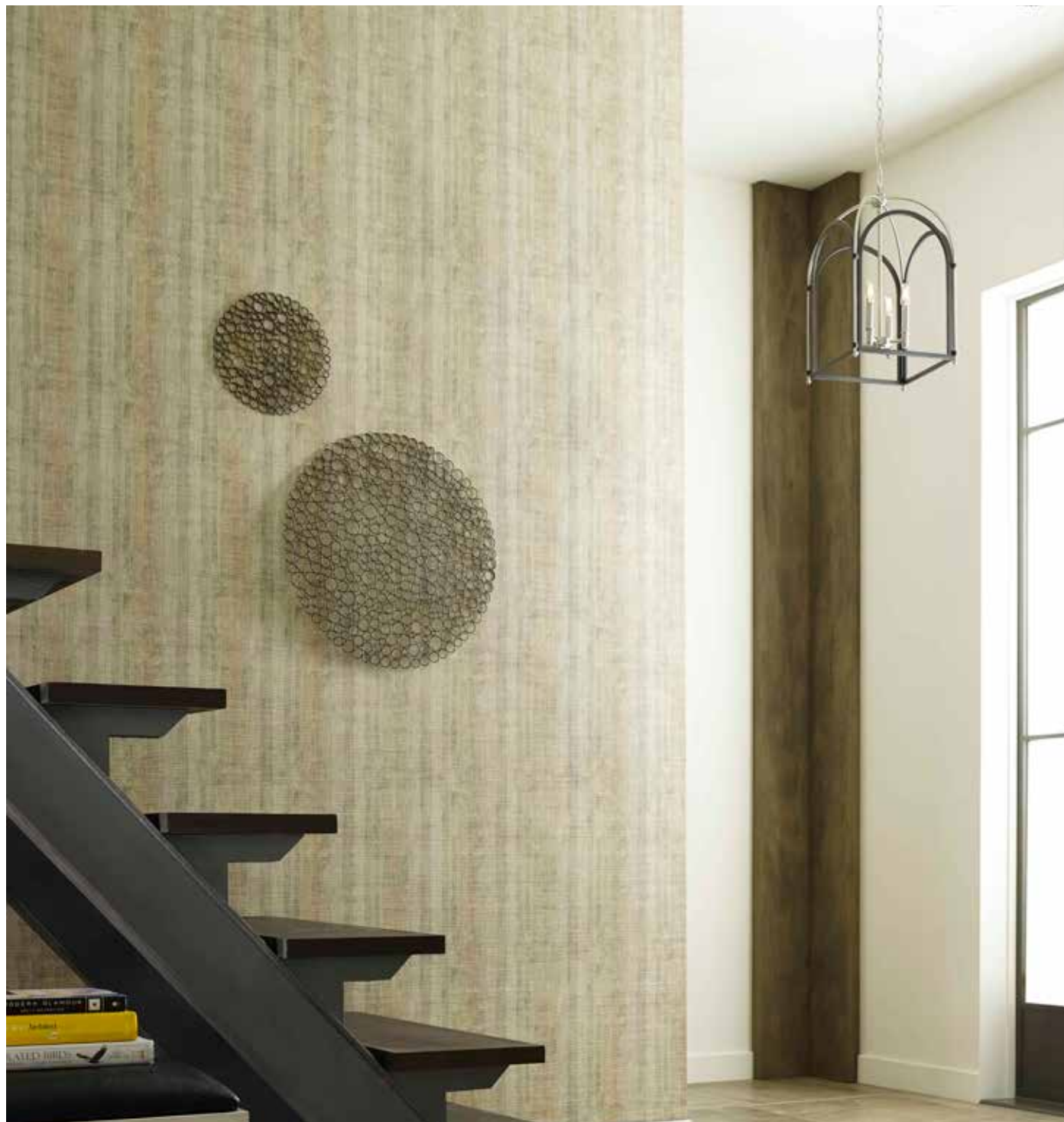
Brush Stroke | 34" wide | 17" horiz. x 18" vert. repeat | 8 yd. rolls