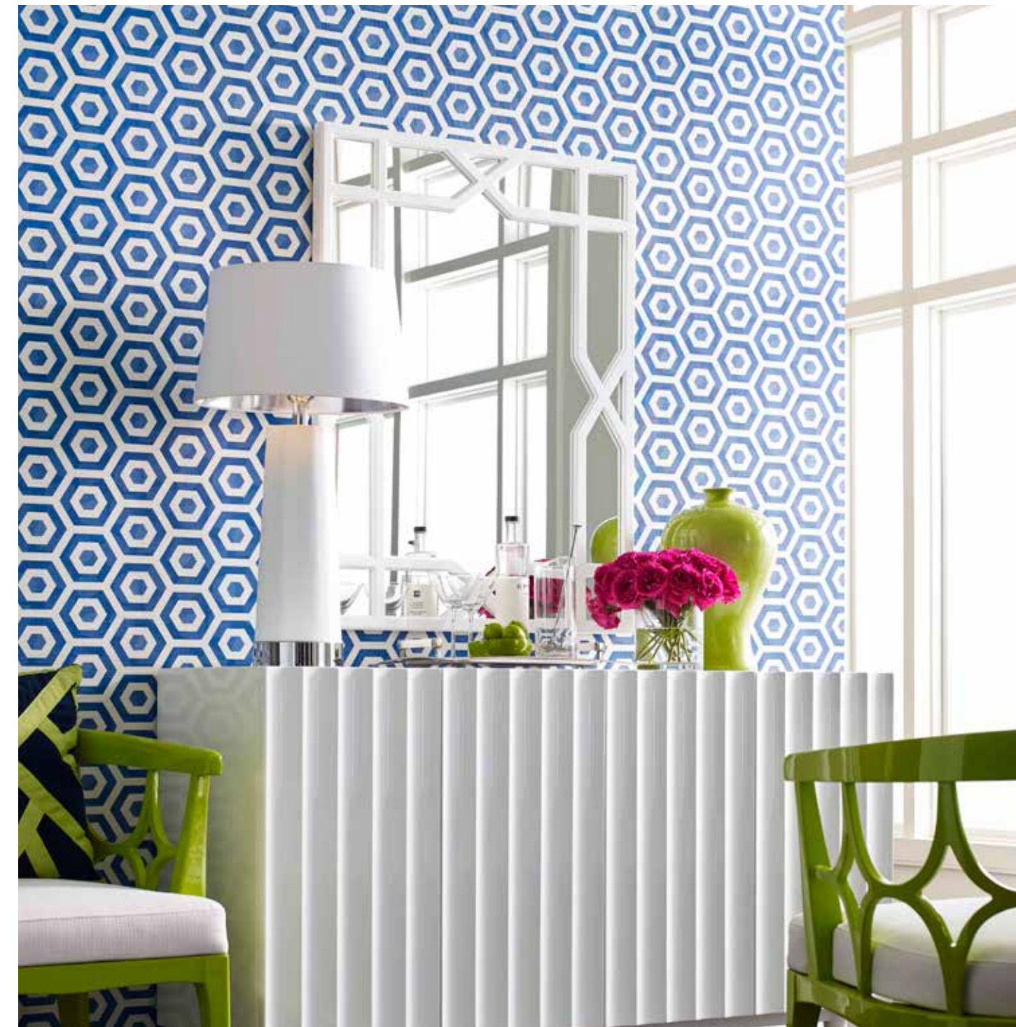
Pop | 34" wide | 17" horiz. x 18" vert. repeat | 8 yd. rolls