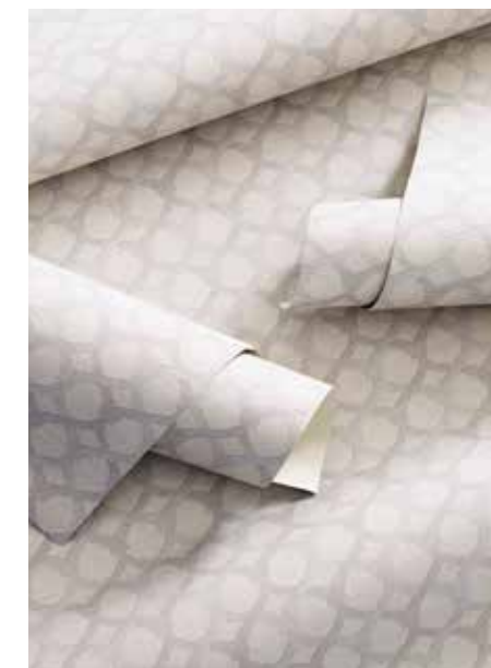
Chain | 34" wide | 4.25" horiz. x 4.5" vert. repeat | 8 yd. rolls