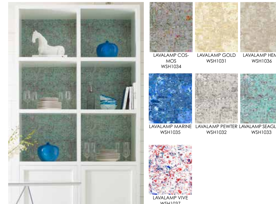
Lavalamp | 34" wide | 17" horiz. x 18" vert. repeat | 8 yd. rolls

Lavalamp's reflective grasscloth ground, groovy lines and diverse color range evoke the psychedelic glow of the 60's, creating movement and mystery.