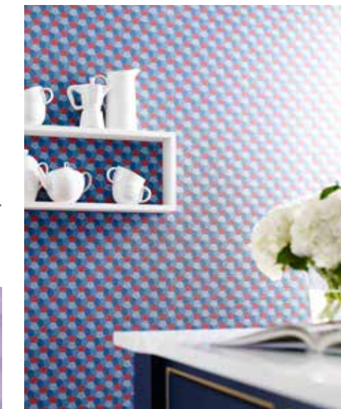
Alder | 34" wide | 2.83" horiz. x 3" vert. repeat | 8 yd. rolls